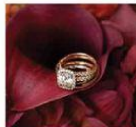
CLOCKWISE FROM TOP: Ring bearers wore blue jackets, hot pink bow ties and orange boutonnieres; Cate's engagement ring came with Craig's surprise proposal during a Central Park walk; post-ceremony, a bridesmaid tried on a flower girl head wreath; the St. Regis funicular lifted guests up to the lodge; a clear tent canopied the outdoor plaza allowing guests to be protected from inclement weather, yet still take in the mountainside ambiance.