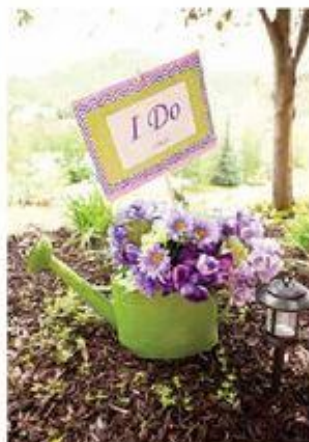
CLOCKWISE FROM TOP: "Endive in Love" salad; guests mingle on the back patio before the luncheon starts; paper signs present the party's color scheme; the bride and groom's initials hang on front door—and make a great gift for the duo to take back to their new home.

drinks including "Marry Me Mimosas" and "Lavender Love Lemonade" refreshed taste buds to get the backyard luncheon started.